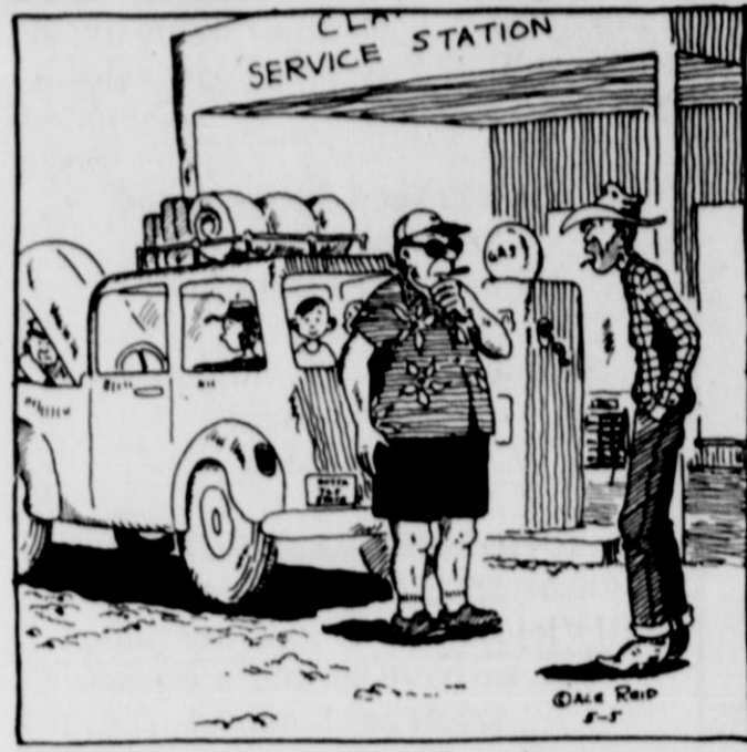
"So you wanna know what I do in this country... wul, I sweat and swear a lot!"

THIS FEATURE SPONSORED BY FIRST STATE BANK