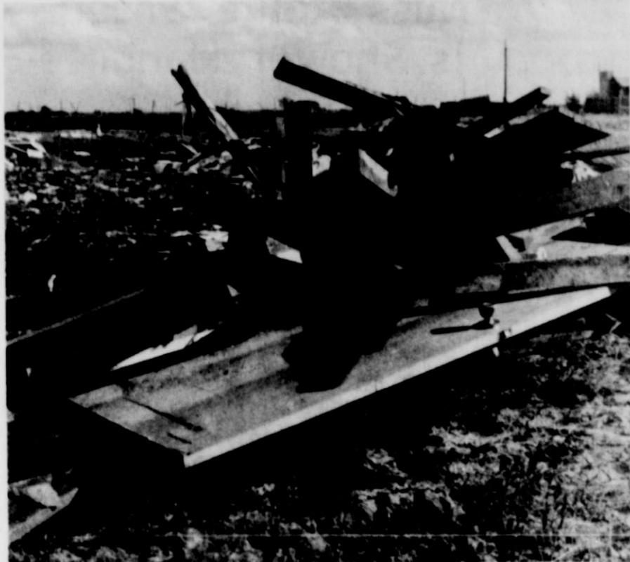
DEATH HOUSE LEFT IN SHAMBLES - A violent storm Sunday night left three persons dead and demolished their home on Barrel Creek Ranch. Rubble and debris was strewn over 200 yards from the house.