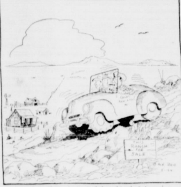
"Yep, folks, if you don't mind droughts, dust, tornadoes, snakes, spiders and stinging scorpions, you're gonna love this place!"

This feature sponsored by THE FIRST STATE BANK