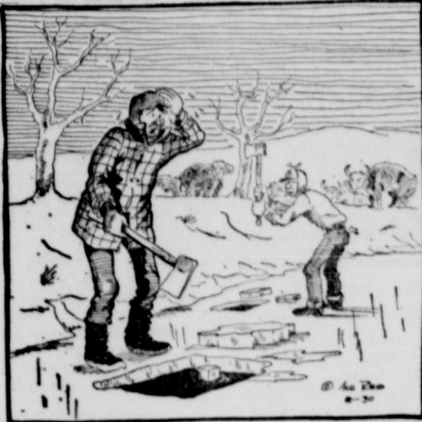
"It's all time, chop post, chop wood, chop ice. Boy, I break out with a sweat when I just look at an axe handle."

This feature sponsored by THE FIRST STATE BANK