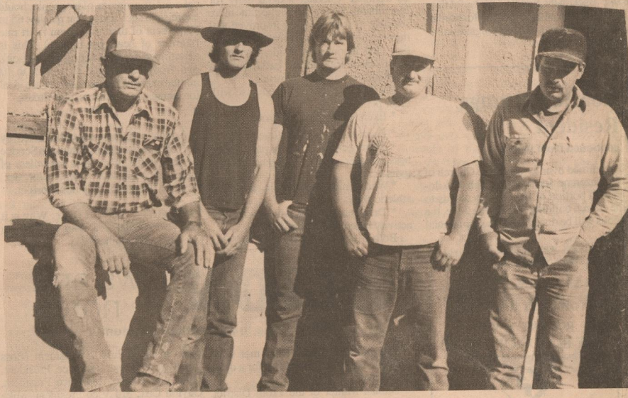
THE MOTLEY COUNTY MUSEUM extends their appreication to Meredith Construction, Roaring Springs, for their assistance and good attitude in refurbishing the old Traweek Hospital into a special place for a county museum. Work has now been completed and the facility is expected to open in August with displays and exhibits pertaining to the colorful history of the county. Historical artifacts and objects, as well as family histories and photographs, are needed. All names collected to date for the Family Name Plate will be sent in by June 15 to be engraved. Those wishing to add names by donating $100 per family name should contact Glenn Woodruff, Marisue Potts, or Hazel Donovan as soon as possible. Members of the general contracting firm which handled everything from plumbing, masonary, painting, and repair are: (1-r) Joe Meredith, Shirrarr Ashley, Yancey Meredith, Randy Meredith and Cody Meredith. Mr. Joe Meredith has been in the Carpentry business for almost 30 years. Three of his employees are his sons and one is a nephew. His grandson, Jeremy Jones, also works with the crew in the summer, making this Construction Company a real family business.