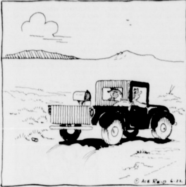
"I wonder who this feller rural patron is—I keep gettin' his mail!"