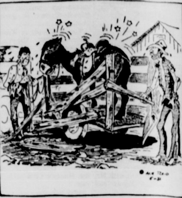
See, it ain't no trouble fechin' an ol' hoss to load. Jist gotta have patience!

This feature sponsored by THE FIRST STATE BANK