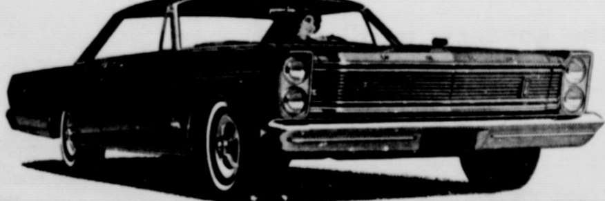
1965 Ford Galaxie 500/XL 2-Door Hardtop

FORD Matador Auto Company MERCURY U. S. Highway 70 at Main Street Matador, Texas