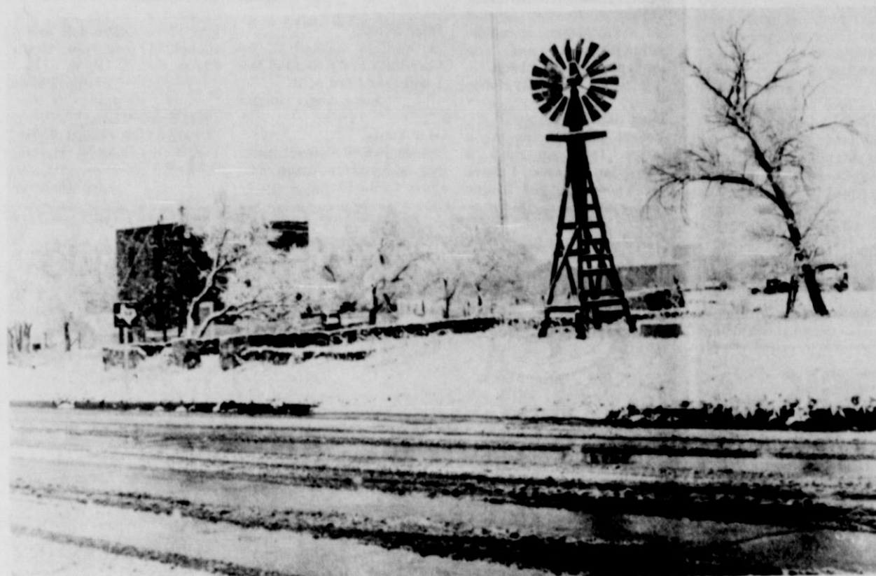
DREAMING OF ANOTHER WHITE CHRISTMAS? - Last year's "perfect" snow fell during the night of Dec. 23 and continued through Christmas Eve, when the above