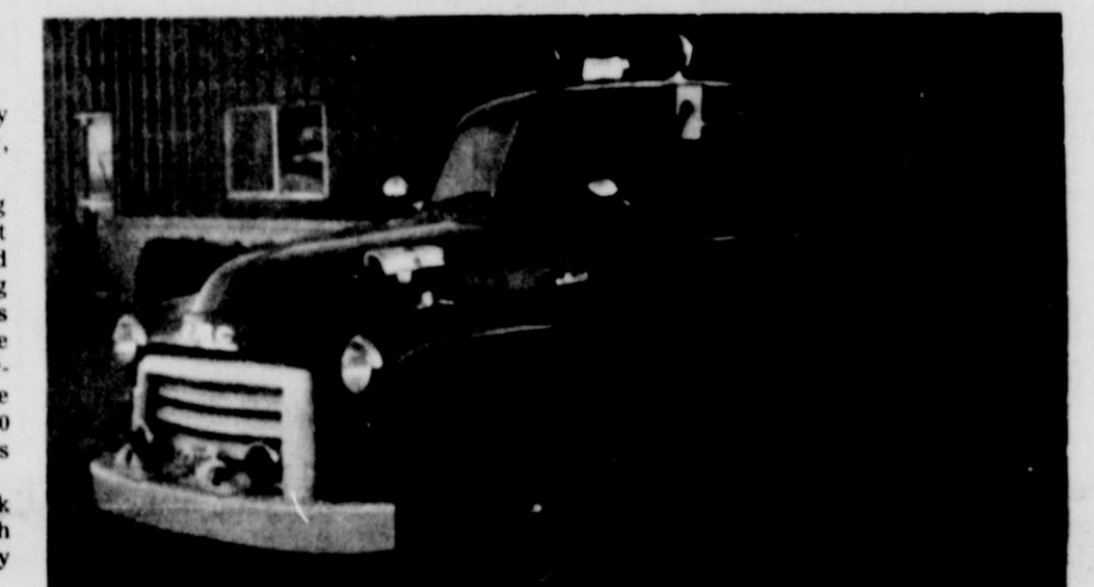
"OLD JIMMY" - Matador Volunteer Fire Department's 1952 GMC fire truck recently received a new coat of paint and some new emergency equipment. Although the fire department has a new truck, "Old Jimmy" is still in use and performs auxiliary duty.