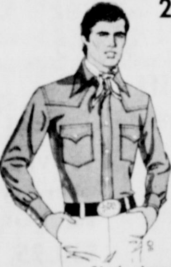
Student pants Levi and Maverick Reg. $12.00 Now $9.95