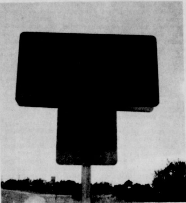
BICENTENNIAL LOGO designating Motley County as a bicentennial community was placed this week by the highway department on the county seat's city limit sign.