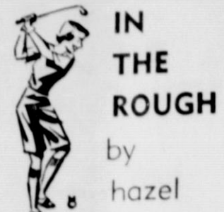
IN THE ROUGH