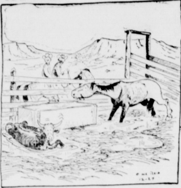
"Say, reckon when the boss is gonna tell us to fix that leaky water trough?"

This feature sponsored by THE FIRST STATE BANK