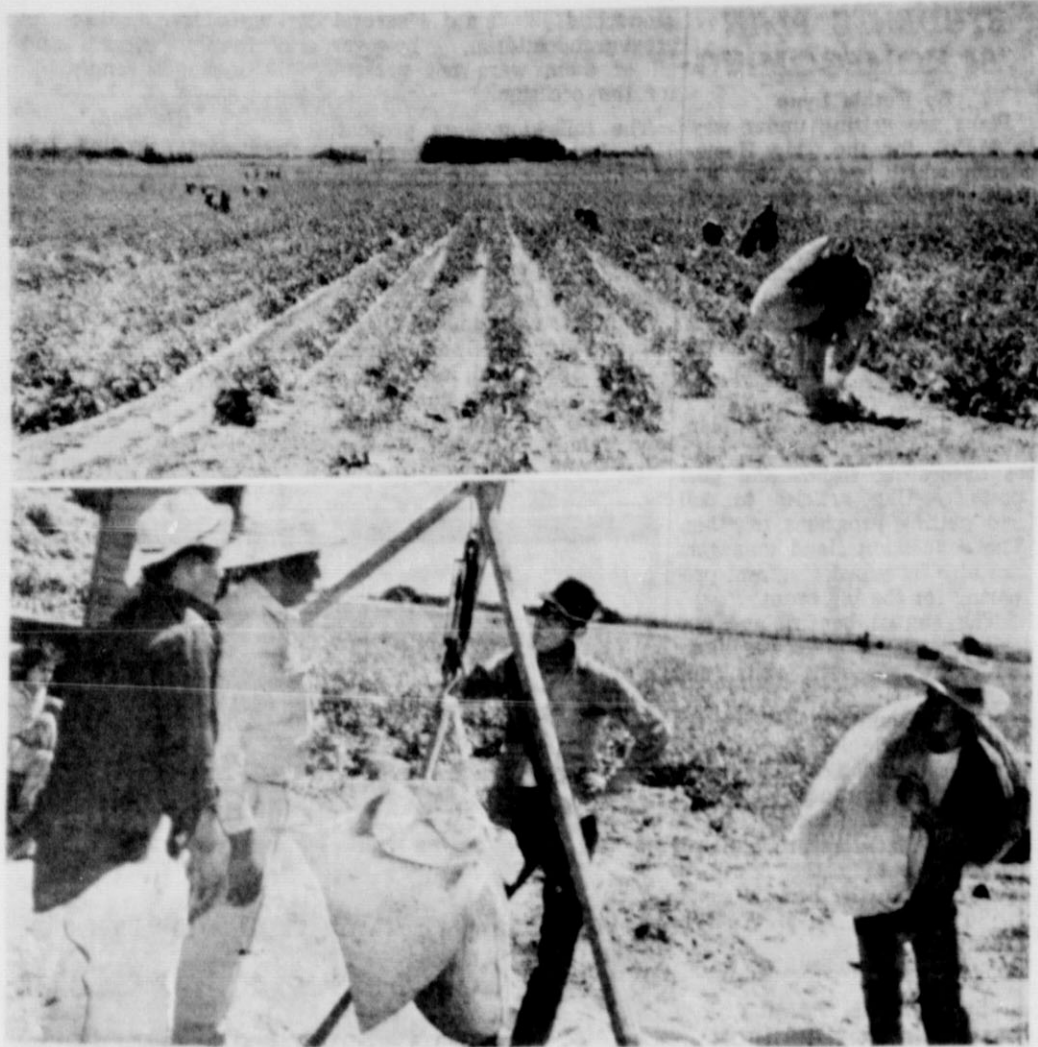
BEFORE THE RAINS —These scenes were made on the Newton Fletcher farm about two miles southeast of Roaring Springs during the harvest of green blackeye peas. The crop netted approximately $20 per acre in spite of extremely dry weather. Fertilizing value of pea vines is estimated to be worth $10 per acre. Peas were harvested by Latin-American labor similar to cotton harvest. Lower photo shows picked peas being weighed before being loaded in waiting truck which rushed the peas to a cannery.