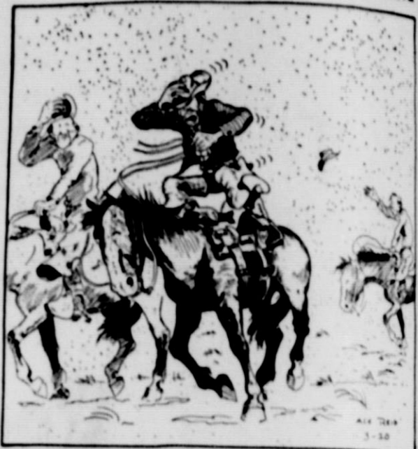
"I've been thrown off a many of hoss, but this is the first time I ever got blowed off!"

This feature sponsored by THE FIRST STATE BANK