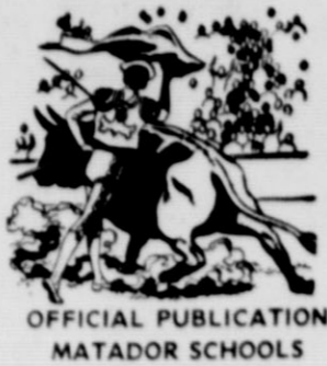
OFFICIAL PUBLICATION MATADOR SCHOOLS