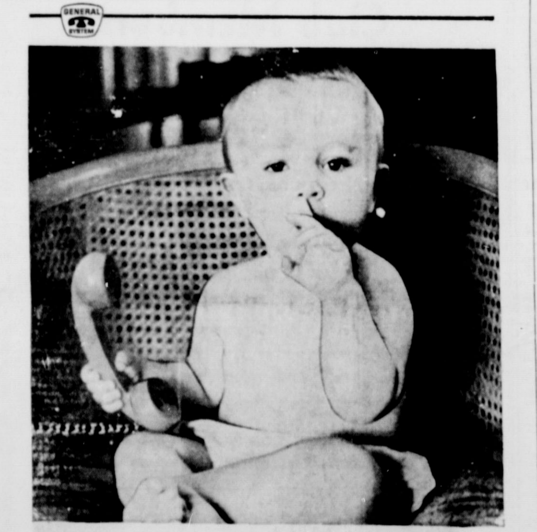
"Sh-h-h! Don't wake the baby. I'm talking from the bedroom on an extension telephone."