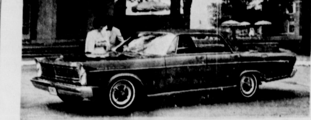
The 1965 Ford is the most-changed in the 15-year history of Ford Division. The traditional, round Ford taillight is replaced by a modernistic hexagonal shape in keeping with the crisp, elegant look of the new Ford. Luxury styling is combined with a luxury car ride described as so smooth and so quiet the heater and air conditioner fans had to be moved into the engine compartment because their low-toned whirr was distracting. A luxurious new Ford Galaxie 500 LTD series (above) features an interior of quality and style previously obtainable only in higher-priced cars. Five separate roof lines are offered with interior and exterior trim features to give greater distinctiveness to each of the 17 models than ever before. The complete line of 1965 Fords — two- and four-door hardtops, sedans, convertibles and station wagons — will be introduced in Ford dealer showrooms on Friday, September 25.

For those who comply with the program, price support is $1.25 per bu. They will also receive domestic marketing certificates of 75¢ per bu. on a maximum of 45% normal production of the farm allotment, and an export certificate of 30¢ per bu. on a maximum of 35% the normal production of the farm allotment.