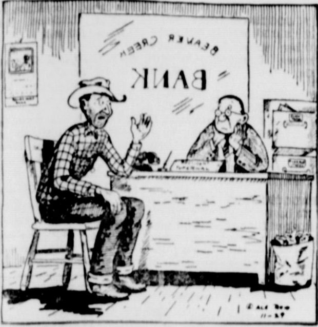
"Sir, it's like this. I wuz offered 35c on them 28c calves, but I wuz holdin' out for 40c. Now sir, I reckon we're gonna hafta feed them 21c calves 'til spring."

This feature sponsored by THE FIRST STATE BANK