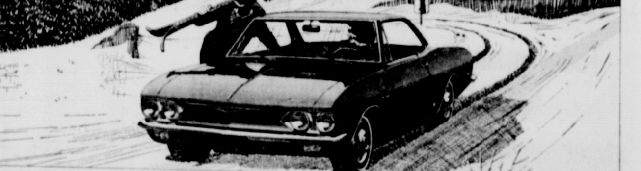
CORVAIR — The only rear engine American car made. Corvair Corsa Sport Coupe

When you take in everything, there's more room inside this car than in any Chevrolet as far back as they go. It's wider this year and the attractively curved windows help to give you more shoulder room. The engine's been moved forward to give you more foot room. So, besides the way a '65 Chevrolet looks and rides, we now have one more reason to ask you: What do you get by paying more for a car — except bigger monthly payments?