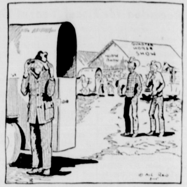
"Wul, I can see the boss judgin' over. Let's stick around for the fight!"

This feature sponsored by THE FIRST STATE BANK