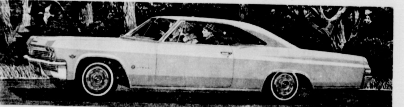
CHEVROLET — As roomy a car as Chevrolet's ever built. Chevrolet Impala Sport Coupe

When you take in everything, there's more room inside this car than in any Chevrolet as far back as they go. It's wider this year and the attractively curved windows help to give you more shoulder room. The engine's been moved forward to give you more foot room. So, besides the way a '65 Chevrolet looks and rides, we now have one more reason to ask you: What do you get by paying more for a car — except bigger monthly payments?