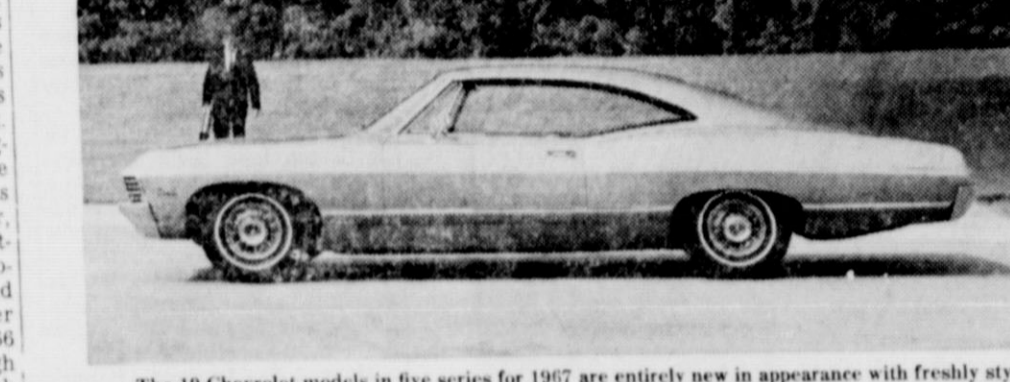
The 19 Chevrolet models in five series for 1967 are entirely new in appearance with freshly styled fenders, hood, grille, bumpers and taillamps. Bright fender wrap-arounds extend grille styling on all models, while fender lamps are featured in the wrap-around area on Caprice models. The exclusive new sport coupe roof line (above) stresses fastback styling with the rear window blending into the deck in an unbroken line. A four-way hazard flasher is now standard equipment on all '67 Chevrolets. Dealers throughout the nation will display the new Chevrolets on September 29.

as old watches, jewelry, dentures with bits of gold, and damaged silver.