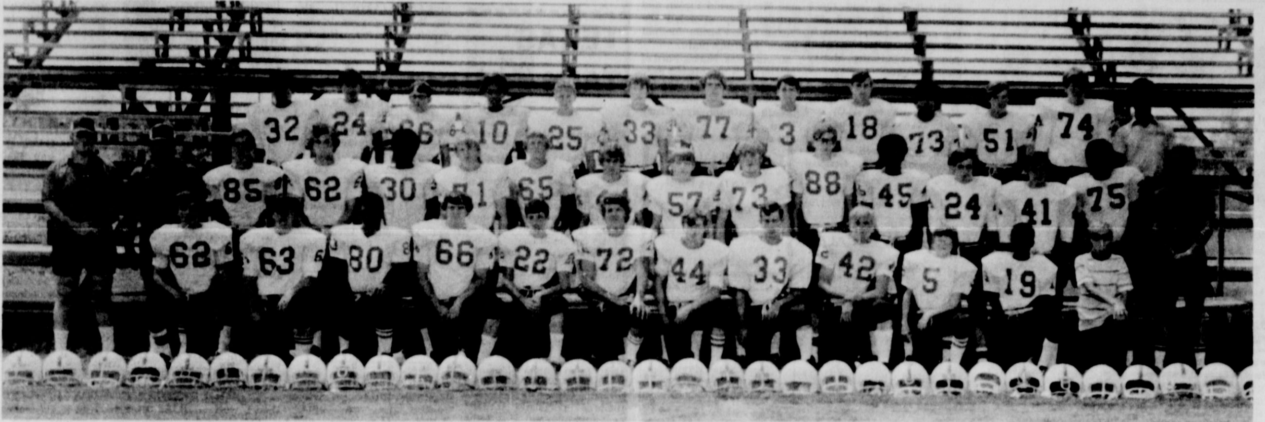
1975 -- 1976 MOTLEY COUNTY MATADORS