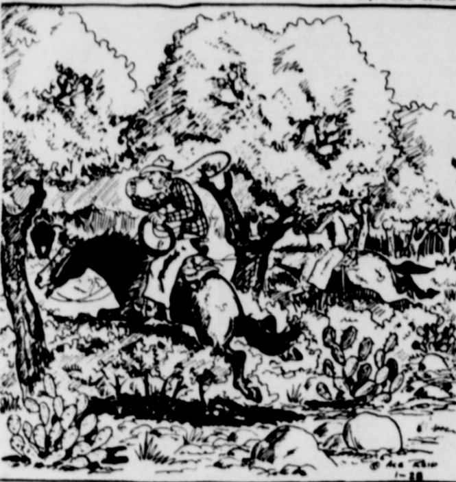
"The government is always helpin' us dig tanks and build fence, I just wonder if we could git 'em to help us gather these ole brushy steers."

THIS FEATURE SPONSORED BY FIRST STATE BANK