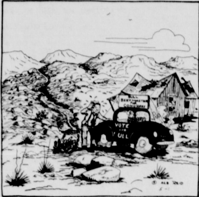
"Don't complain, Bull. That's the road you promised last election."

This feature sponsored by THE FIRST STATE BANK