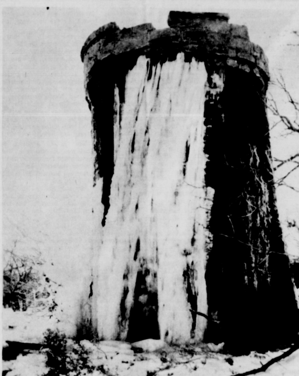
ICE FOR A TALL ONE—The above photo was made last week at the Matador Ranch headquarters here. The Scotch influence is evidenced in the architecture of the water supply reservoir, constructed from native stone more than half a century ago. The pure spring water is piped from West Tank several miles away in the Foothills. When the tank was first built the water was obtained at historic Ballard Springs, a few hundred yards away. The big icicle was formed last week when the tank overflowed during sub-freezing weather. Much colder weather has prevailed in the past several days and some of the snow which fell over ten days ago is still on the ground.

"I will greatly appreciate any service rendered in the interest of my campaign, and offer in advance, my deepest gratitude for any effort to aid me in this race."