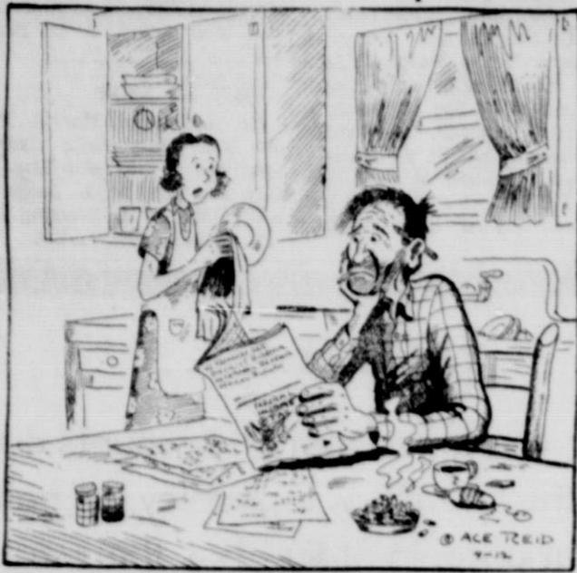
"My gosh, Jake, during the drought you cried about not makin' any money. Now you're cryin' 'cause you made some."

This feature sponsored by THE FIRST STATE BANK