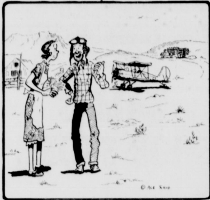
"Maw I jist traded that ole dumb boy at the airport $800 worth of sorry calves for that nice airplane and a $1,000 worth of flyin' lessons!"

This feature sponsored by THE FIRST STATE BANK