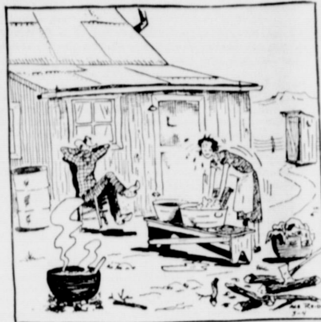
Mow, if you can give up a few of your luxuries, we can buy that adjoining' land.

This feature sponsored by THE FIRST STATE BANK