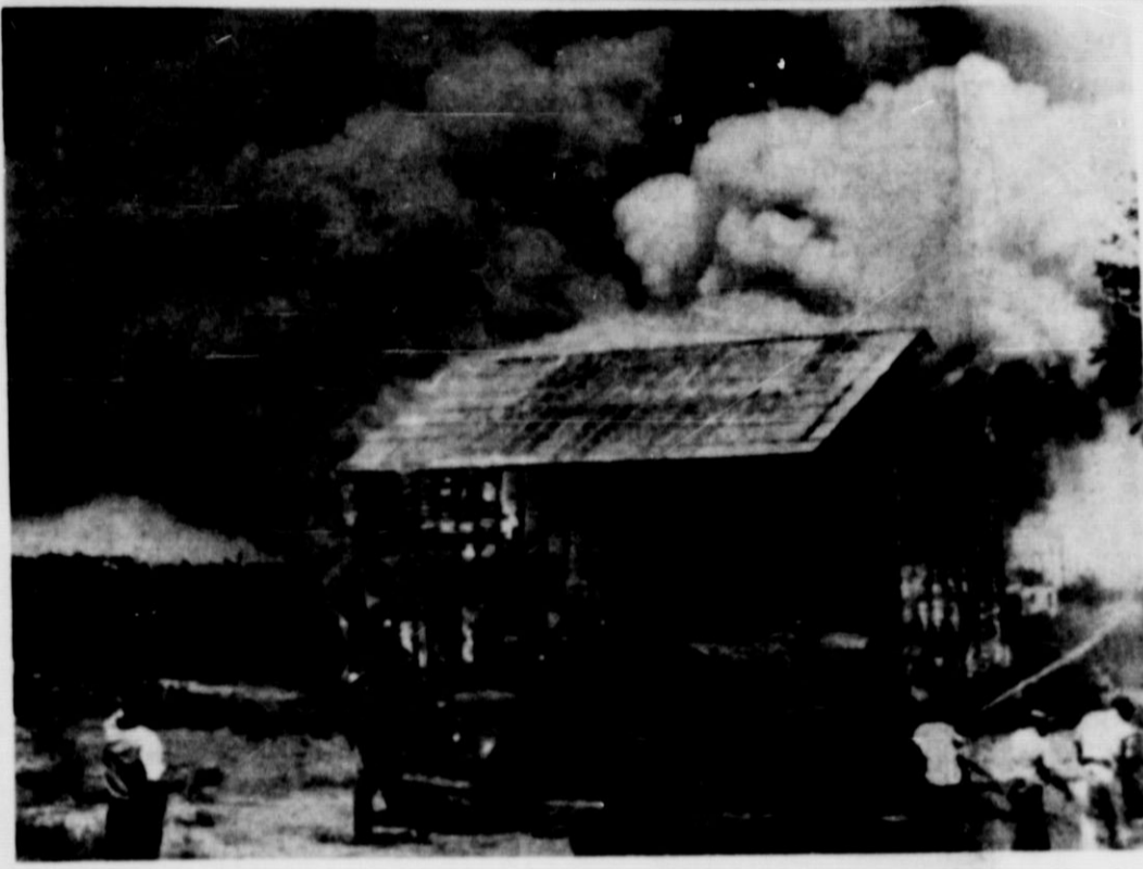
FLAMES AND SMOKE from West Texas Gin old cotton building fire here Monday. Matador Volunteer Fire Department Truck No. 1 was at right, also engaged in protecting other buildings. The fire was beyond control when the alarm was sounded. High winds also made work more difficult for the firemen.