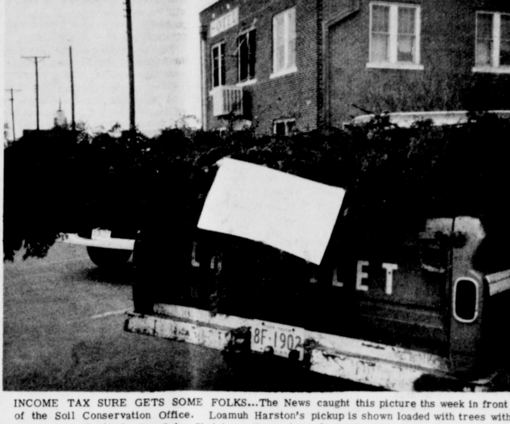
of the Soil Conservation Office. Loamuh Harston's pickup is shown loaded with trees with a sign on the back, For Sale, Christmas Trees (cheap). Doubt if he will do much business

The couple will make their home at 3201 35th street in Lub-