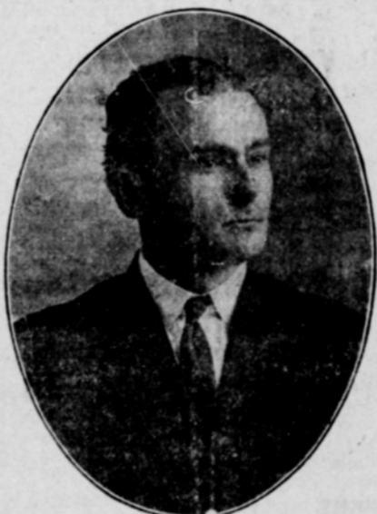
A. E. WHITE AGRICULTURE