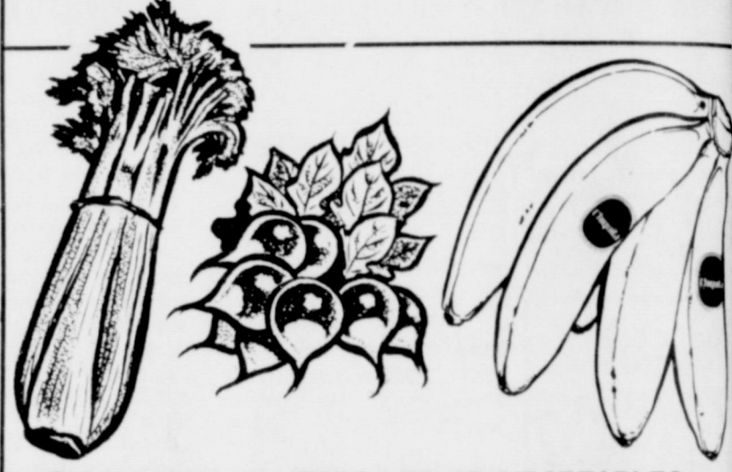
PIGGLY WIGGLY FRESH FRUIT-VEGETABLES

JOHNSTON FRESH FROZEN PUMPKIN PIES family size 49 c