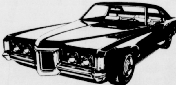
1969 GRAND PRIX HARDTOP COUPE

MONDAY Barbecued Franks, Potato Salad, Corn Bread, Tomato Relish, Butter, Milk, Chocolate Pudding.