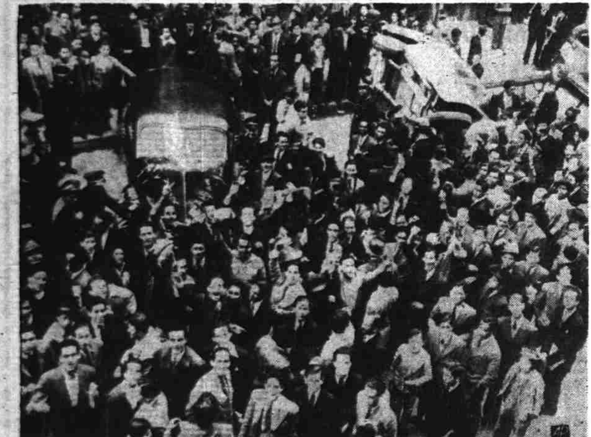
STUDENTS DEMONSTRATE AT BOGATA — Crying "Down with Yankee imperialism," students at Bogata, Colombia, gather before the U. S. embassy, overturn an embassy car and stone the building in protest against the ending of certain privileges of the merchant shipping fleet owned jointly by Colombia, Ecuador and Venezuela.

TRIESTE, Sept. 15. (AP)—Rioting in downtown Trieste brought hand grenade explosions tonight and injured two men.