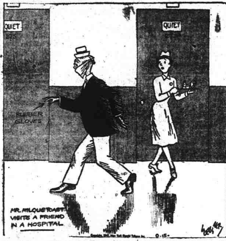
Hal Boyle's Notebook