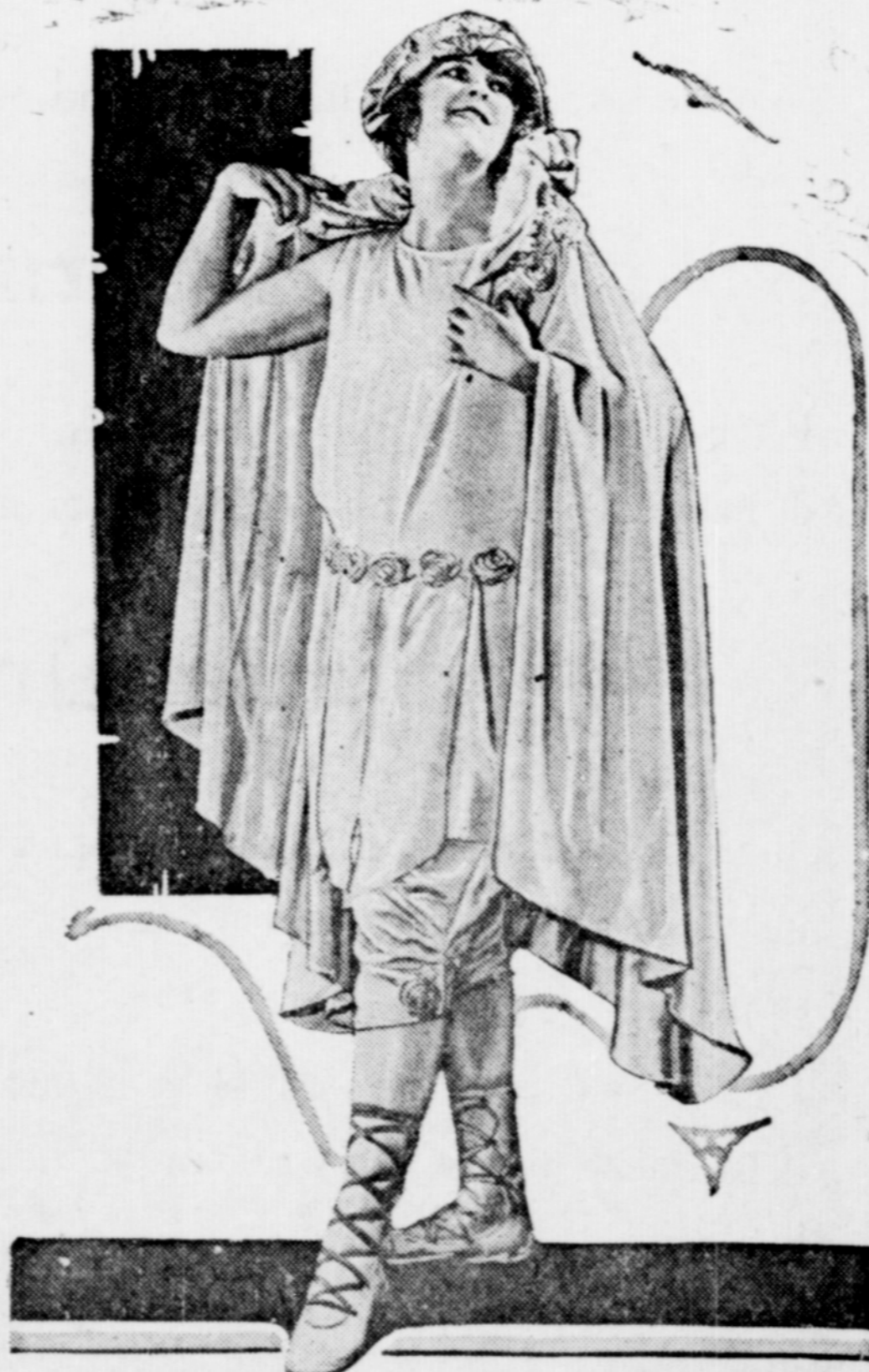
Modest and Beautiful Bathing Suit

Black satin, as always, finds many devotees among those women who are not fond of the high colors that are popular in wool bathing suits. These