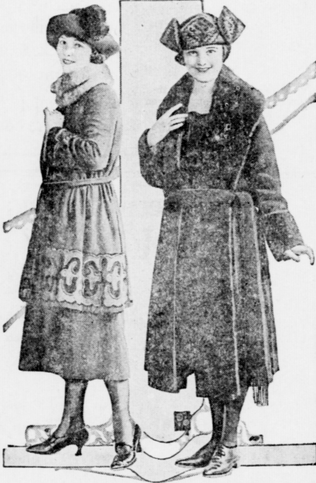
Winter Suits Anticipate Spring Styles

Please note that the wearer of this masterpiece of its particular kind is clothed from head to foot. "In silk attire my lady goes" down to the sea or the sea sands and probably it is