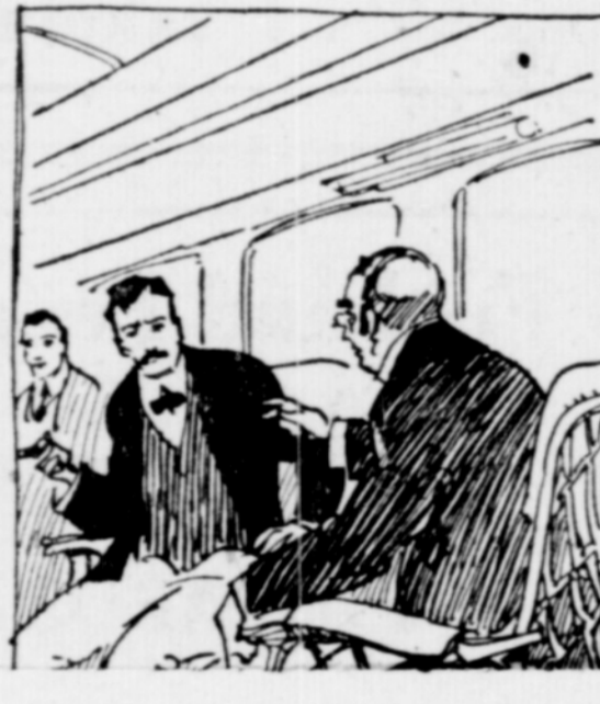
"Who is Dawes?"

"The old story," said Mr. Norcross. "We are bumping over the net result, right now," Mr. Chadwick went on. "Pioneer Short Line is practical-