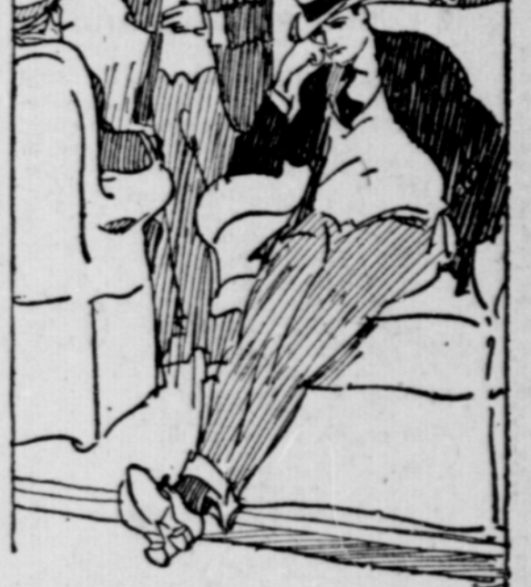
"You Wait and See What Comes Mit the Comiddee Room Out."

"The Dunton bunch got together in one of the committee rooms up-stairs a little after eight o'clock," said the short man, in a low, rasping voice that