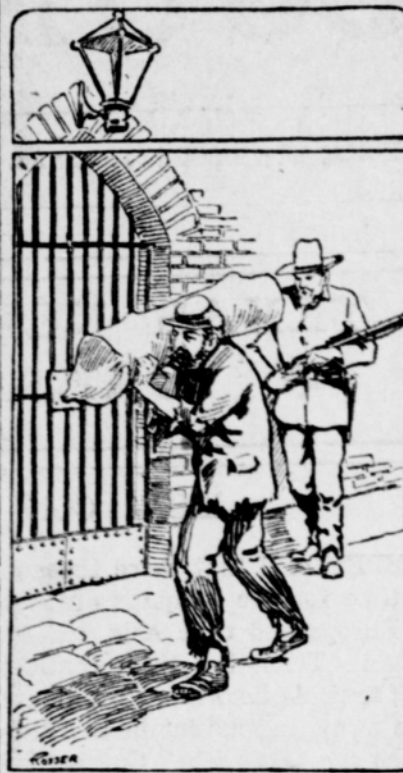
"A Guard to Prick Us With His Bayonet if We Walked Too Slow."

"The big bell in Richmond strikes six, and we close our diary, hoping