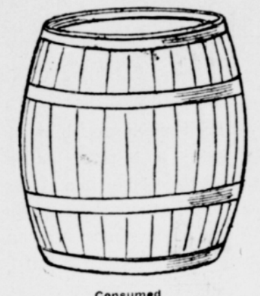
THE TEXAS PORK BARREL.

As a revenue producer, the Texas hog undoubtedly excels every other animal on the globe and enjoys the distinction of being the only animal that can swell a bank account by emptying a swill barrel. He is the favorite of the barnyard, a leader in packing house society and occupies first place in the larder of the consumer. In addition to consuming all the pork we produce, we ship in 100 carloads of pork per week and our annual consumption excels production $24,450,000.