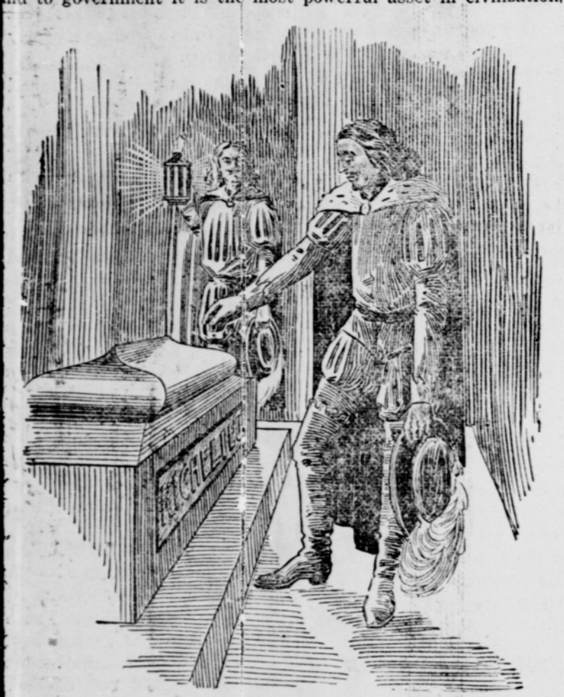
PETER THE GREAT AT THE TOMB OF RICHELIEU.

Knowledge is the most valuable element known in human life and to government it is the most powerful asset in civilization,