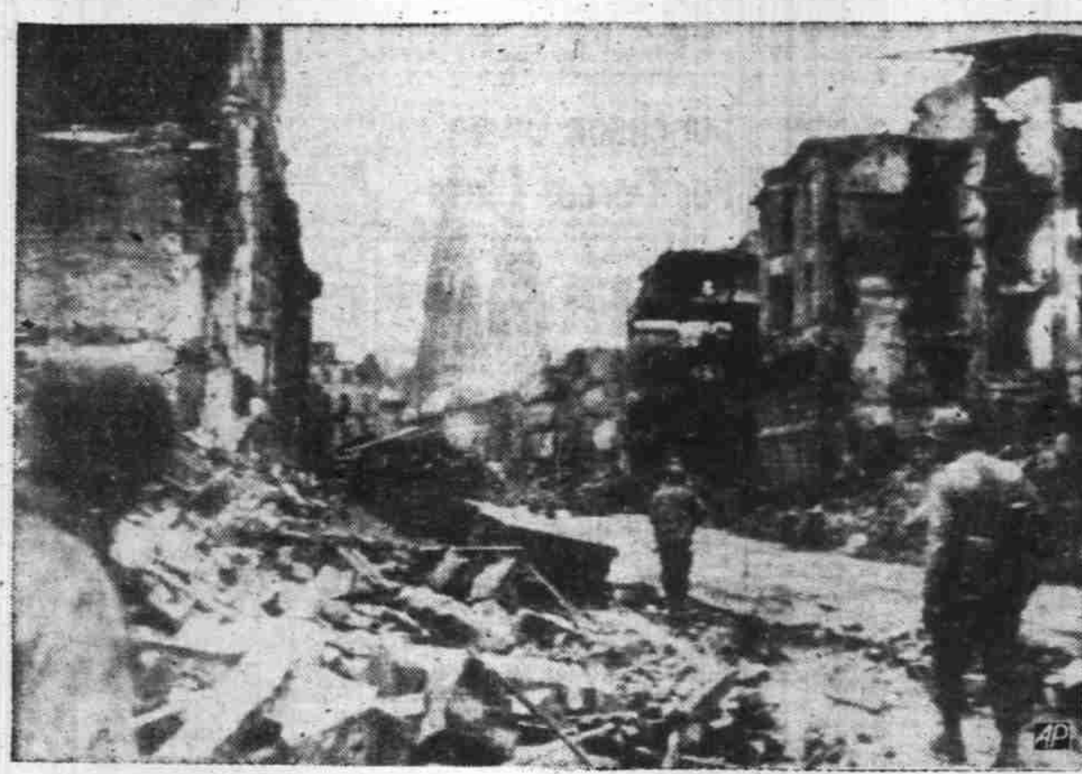
YANKS ADVANCE THROUGH COLOGNE RUINS - Troops of the 3rd armored division, 1st U.S. Army, advance through ruins of Cologne, Germany. Twin spires of famous cathedral appear undamaged in background.