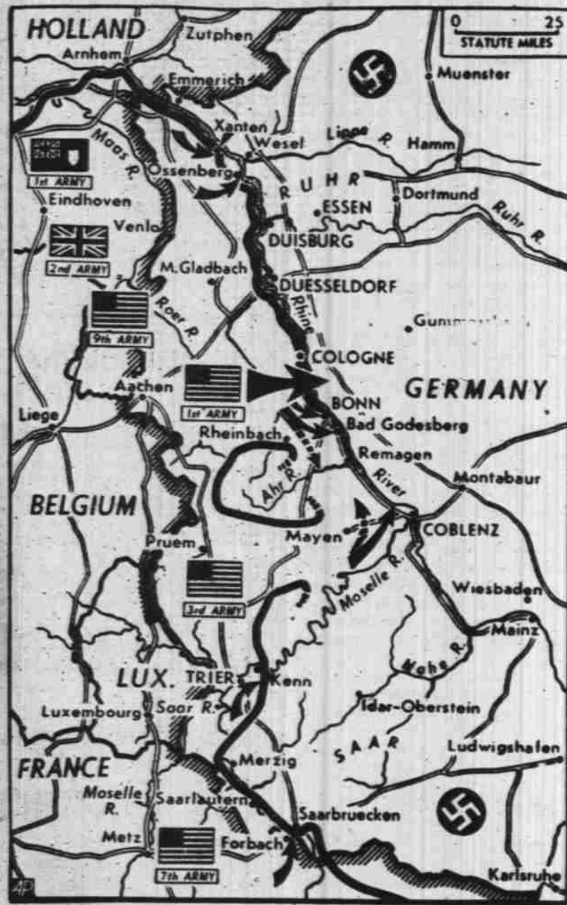
AMERICANS CROSS THE RHINE - Large arrow indicates the crossing of the Rhine river south of Cologne by the U.S. First Army. Other First Army troops have taken half of Bonn and Bad Godesberg, and Berlin reported a thrust (broken arrow) south of the Ahr river. Third Army forces have reached the Rhine near Coblenz.