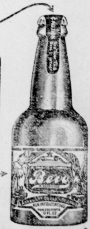
Bevo—the all-year-round soft drink

ANHEUSER-BUSCH ST. LOUIS Nobles Bros. Grocer Co. Wholesale Dealers AMARILLO, TEXAS