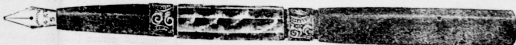
FIELD'S PRIDE FOUNTAIN PEN

"Or the pen FREE with three yearly subscriptions to the 'News' either new or renewals"