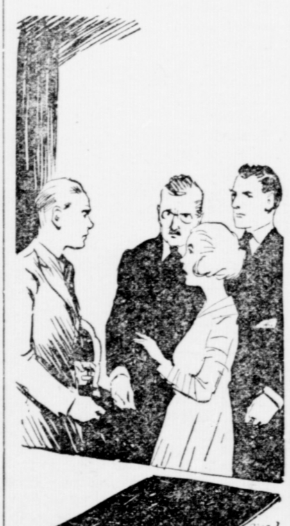
"It's Nothing but Jealousy! He's Said Horrible Things About You!"

"Well," he said desperately, "I know hearsay evidence is no good, so I got it first hand-in your own room in the Onondaga, didn't I? You won't deny that, will you? I didn't just pick up rumors-I got it from you. Didn't I