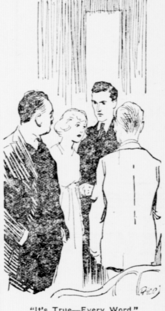
"It's True-Every Word."

. . . Mr. Cullen, I'm going to give you a check for eight thousand dol-Trust and Deposit company, less what I'll need to live on for a few days. I'm going to turn over to you twenty thousand shares in the Silverbow Mining corporation to keep for me-it's my own personal holding. I'm going to turn over to you my contract with the mining corporation, which calls for the delivery of all the rest of the corporate stock on payment of a hundred and twenty thousand dollars, of which covery. By the use of this they were all we've already paid sixty-two. I'll give restored to health and strength. you the corporation's receipt to me for that amount. And I give you my word