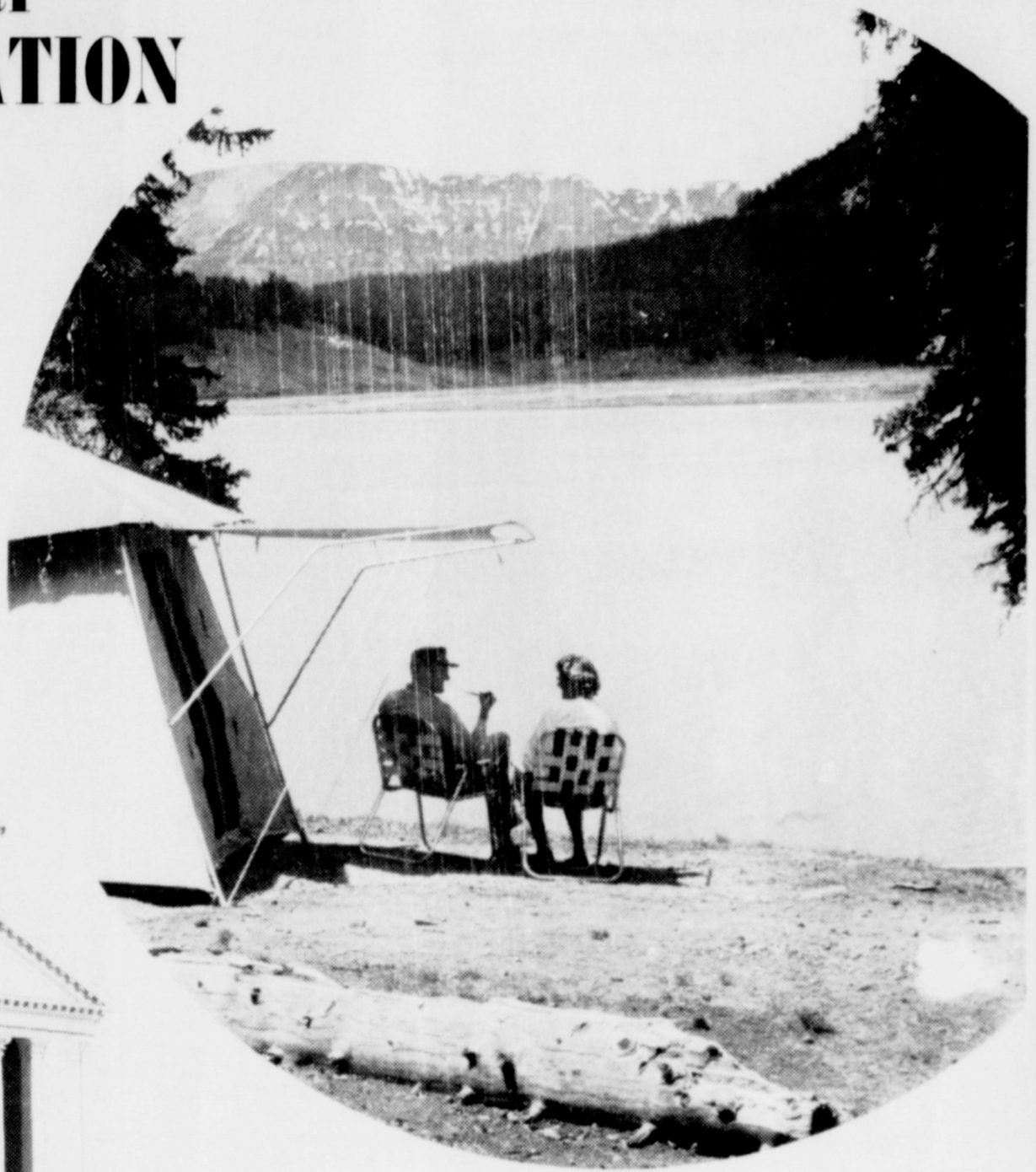
THE CHURCH FOR ALL . . . ALL FOR THE CHURCH

They had waited for this real vacation — this long trip — for years. But this time it was different, this time he wouldn't be going back to his job.