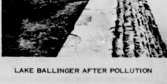
LAKE BALLINGER AFTER POLLUTION