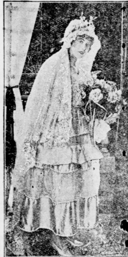
He Could Have Found No More Beautiful and Gracious Partner.

"That's spoken like my own boy," she sobbed. "I don't care what you've done, John. It's nothin' to me how wicked you have been. I'm your mother, and I'd believe in you if they was