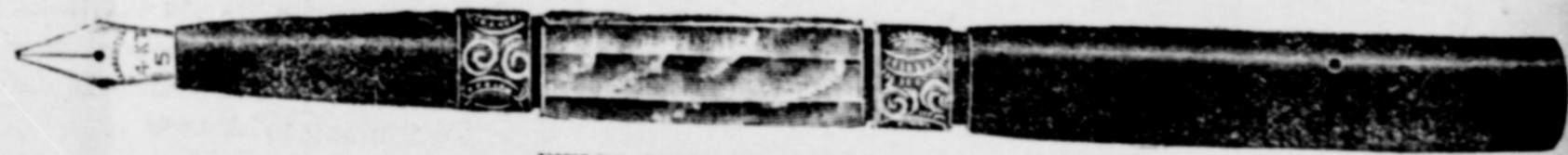
FIELDS PRIDE FOUNTAIN PEN

"Or the pen FREE with three yearly subscriptions to the 'News' either new or renewals"