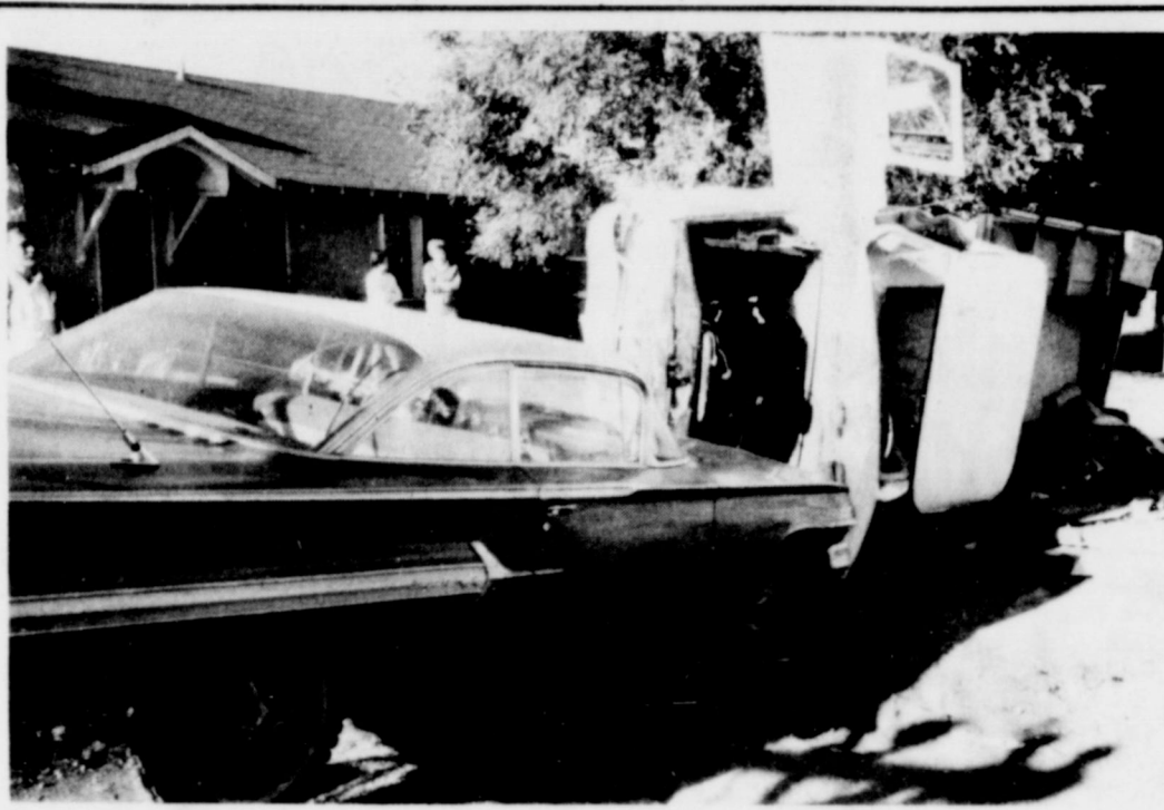
FOUR PERSONS were injured in this two-vehicle accident, Wednesday morning, at the intersection of Lockwood and Ave. O. Tahoka. Extent of injuries was not available at press