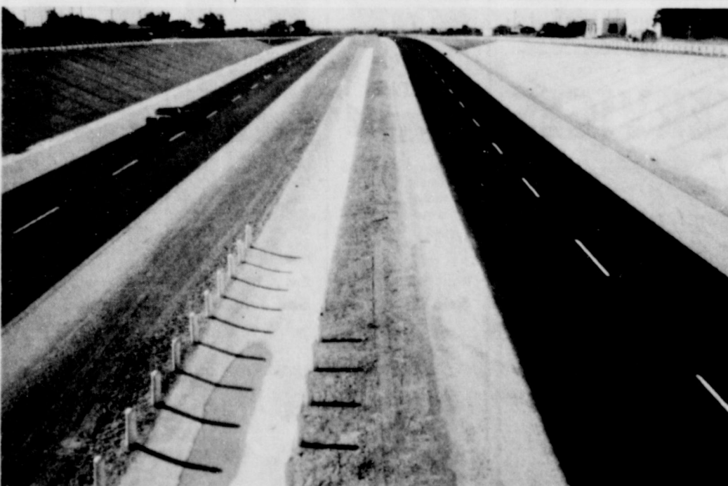
FAST AND NEW are the words to describe the new Highway 87 Tahoka bypass, officially opened last week. The opening has reduced through traffic downtown and also, a trade drop at the local service stations.