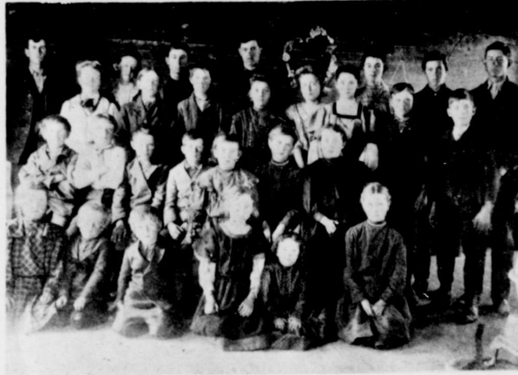
(DO YOU KNOW ANY OF THESE PEOPLE?)