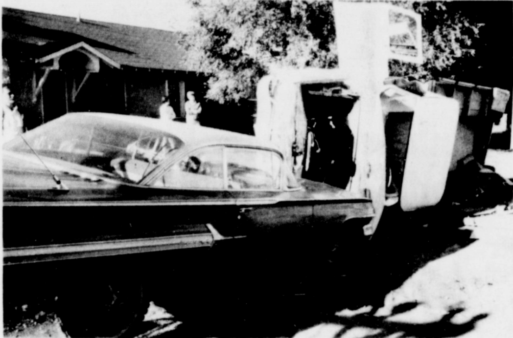
FOUR PERSONS were injured in this two-vehicle accident, Wednesday morning, at the intersection of Lockwood and Ave. O, Tahoka. Extent of injuries was not available at press time.

The rural traffic accident summary for this county during the first eight months of 1968 shows a total of 41 accidents resulting in five persons injured, and an estimated property damage of $44,676.00.