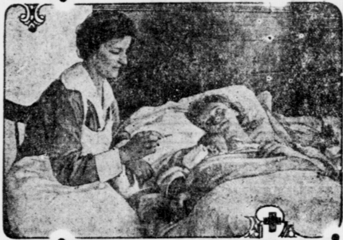
Health is the foundation of human happiness. Through its Rural Public Health Nursing Service and Health Center Service, the American Red Cross aims greatly to strengthen this foundation and to draw more closely than ever the neighborly ties that bind the American people together. Here is shown a Red Cross Public Health nurse attending a young mother with a brand new baby, seeing that both receive scientific care.