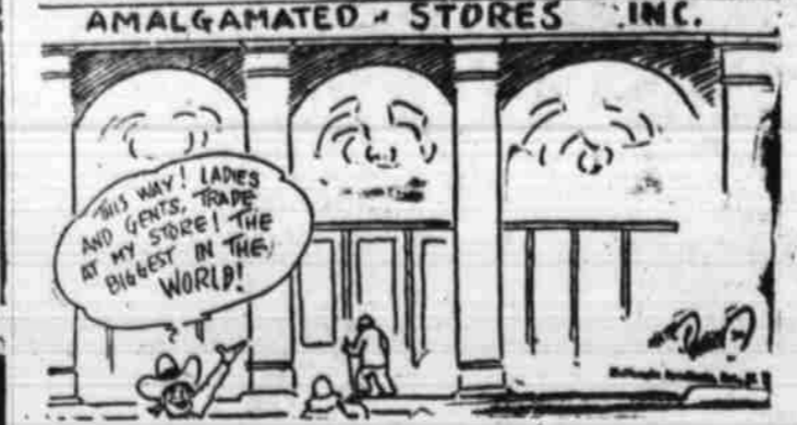
Americans like to patronize the biggest things.

TRACTORS, APPLESAUCE, DICTIONARIES, WHEEL BARROWS, TALCUM POWDER, SAFETY PINS, SODA WATER, STOVE PIPE, SPELLING BOOKS, CHICKEN FEED, UNDERWEAR, AUTOMOBILES, SOCKS, TELEPHONES, POSTAGE STAMPS, HOOEY, DYNAMOS, CEMENT BLOCKS, BONDS, PENCILS, BANANAS, CORN SALVE, LOCOMOTIVES, CHEWING GUM, CANNONS, PICKLES, LARIATS, ETC.