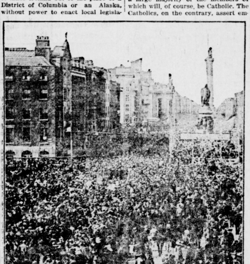
Mass Meeting in Dublin.

The Protestants of Ulster profess to fear some legislative or executive persecution from a Parliament at Dublin,