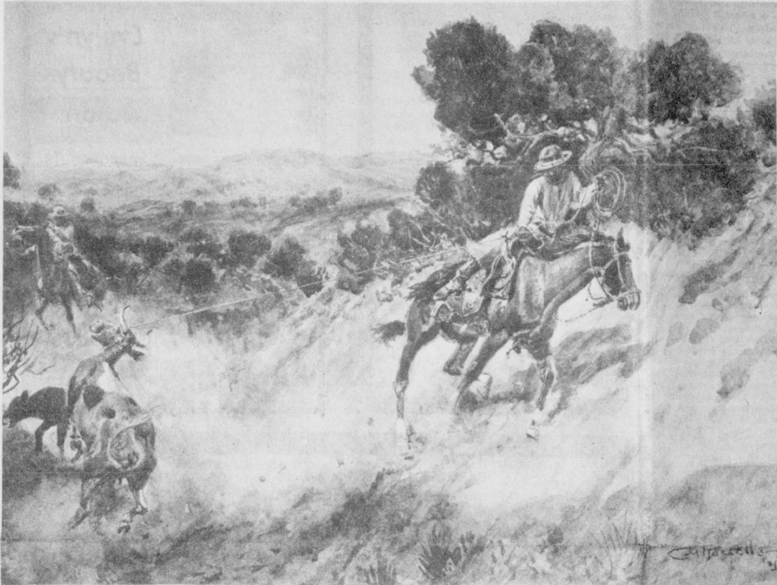
The new telephone directory features this painting by famous western artist Charles Russell. Called "Come Out of There," it is appearing on all 1981 Southwestern Bell phone books throughout Texas.

The Lynx and Lynettes will have their Homecoming basketball game at Lynx gym this afternoon (Saturday, 2 p. m.) Both teams won at Darrouzette last night! Come to Homecoming TODAY, Feb. 14th!