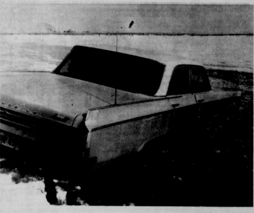
ICE BREAKER - This late model car broke through the ice on a dry weather lake Friday night. Mansel Bryan, the driver, and two other boys were hunting rabbits when they got on the lake. The car was pulled back on top of the ice Saturday morning and off the lake. The car was not damaged.