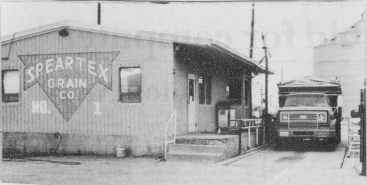
The first load of wheat delivered to Speartex by Perry Dixon.