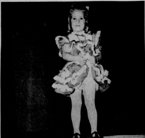
Pretty Study club model---- for '77

All square dancers are invited and the public is invited to come and watch. Come one, come all! They will elect officers at this dance.