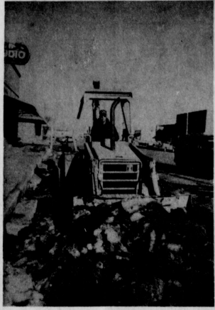
CLEARING UP -- With the sun shining brightly Friday, Feb. 24, city crews got busy c up ice in the gutters along Main Street.