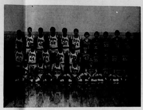
SPEARMAN LYNX AND LYNXETTES

THE NEW 1978 DISTRICT CHAMPION LYNX, AND LYNXETTES-----