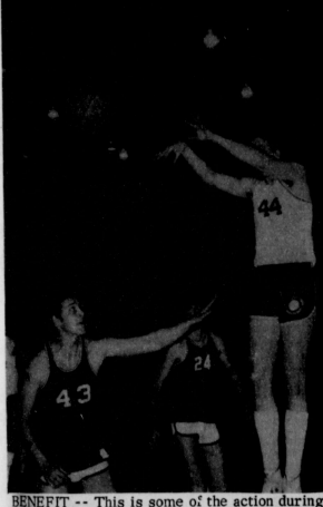
ENEFIT -- This is some of the action during benefit basketball game in Spearman last week with proceeds going to the YMCA Fund.

High School Choice Lasagna FRIDAY, MARCH 3 Submarine Sandwich or Oven Fried Liver - Bread Tater Tots - Catsup Buttered Corn Lettuce-Tomato Salad-Dressing Cookies Milk