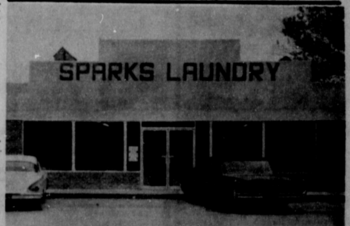
NEW FRONT— Sparks Laundry gets a new front on its building. The laundry has been remodeled inside also.