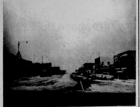
NO PROBLEM -- Snow and cold weather didn't stop traffic on Main Street in Spearman Thursday, Jan. 19, even though the threatening weather, along with the white stuff already on the ground, caused more caution to be taken by drivers.