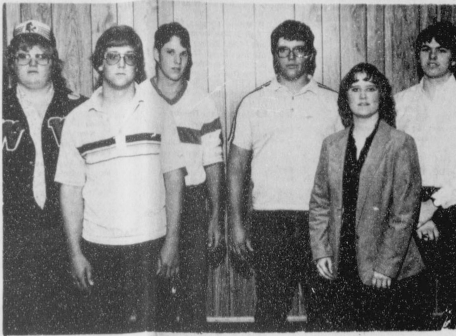
These students have just completed their enrollment for the fall term and will be freshman at Panhandle State University. They attended a special pre-enrollment session for incoming freshmen.