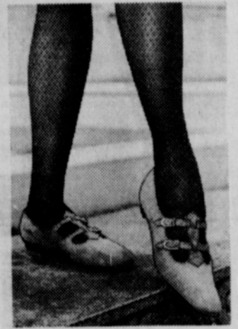
Textured stockings and brushed leather flatties like these help show off teen legs to best advantage this spring. Shoes by I. Miller.

of graceful buckle or bow. Strictly casual are T-strap flatties in grained or brushed leather, waxy and glove leather moccasins, and leather monk-strap slipons. Tidy tieshoes in colorful brushed and grained leathers may also boast ghillie or kiltie themes. Many a leather 'flat' now sits on a slightly higher heel, while pliant leather soles offer