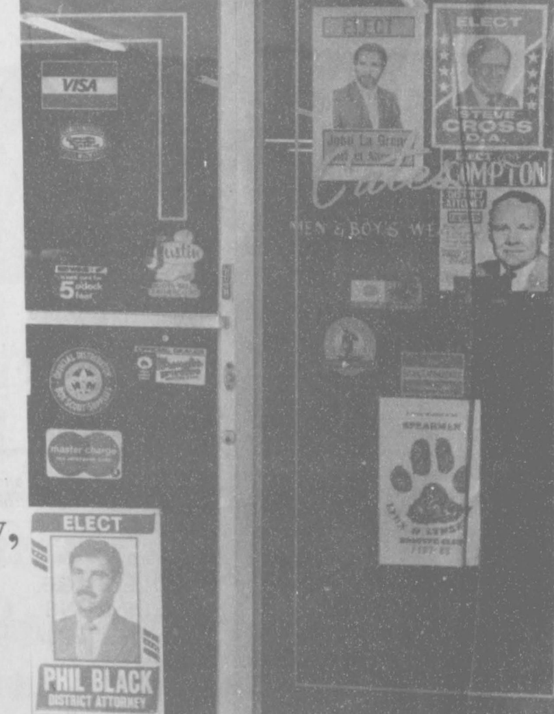
SIGNS OF THESE POLITICAL TIMES . . . a highly contated race for both the Republican and Democratic 84th district attorny's position